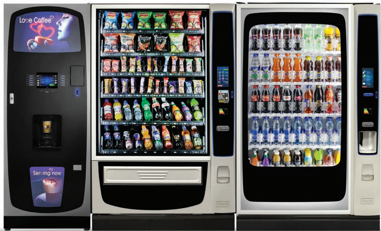
Merchant Media 6 Touch shown fitted with optional base graphic and MEI Cashless reader.